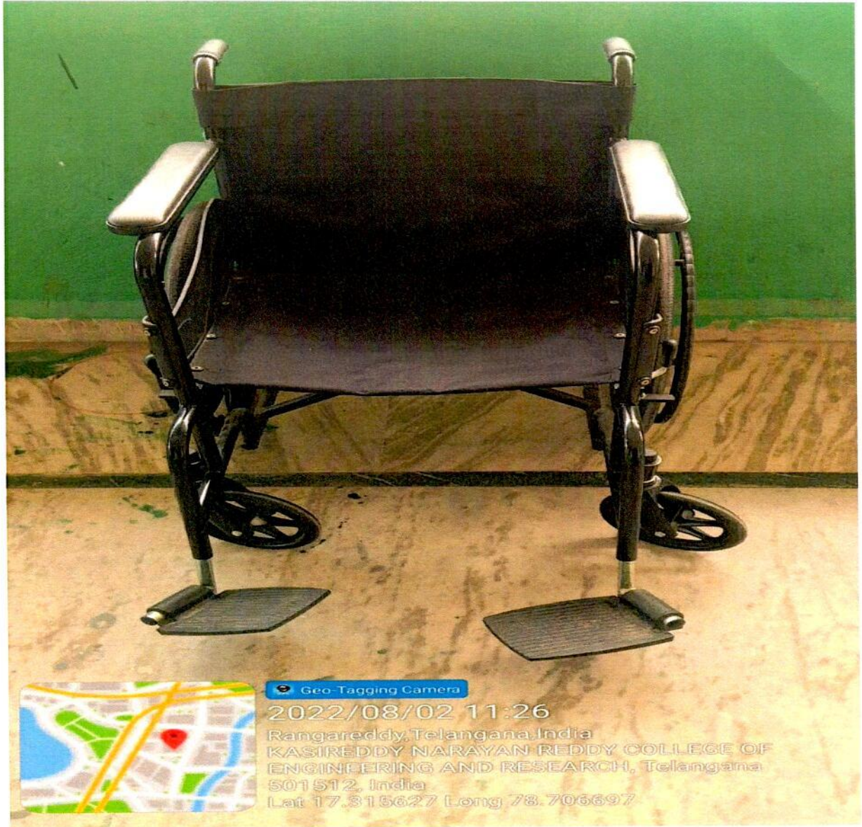
Wheel-Chair Facility at KNR CER

PRINCIPAL KASIREDDY NARAYANREDDY COLLEGE OF ENGINEERING AND RESEARCH Abdullapur (V), Hayathnagar (M). R.R. District-501 505