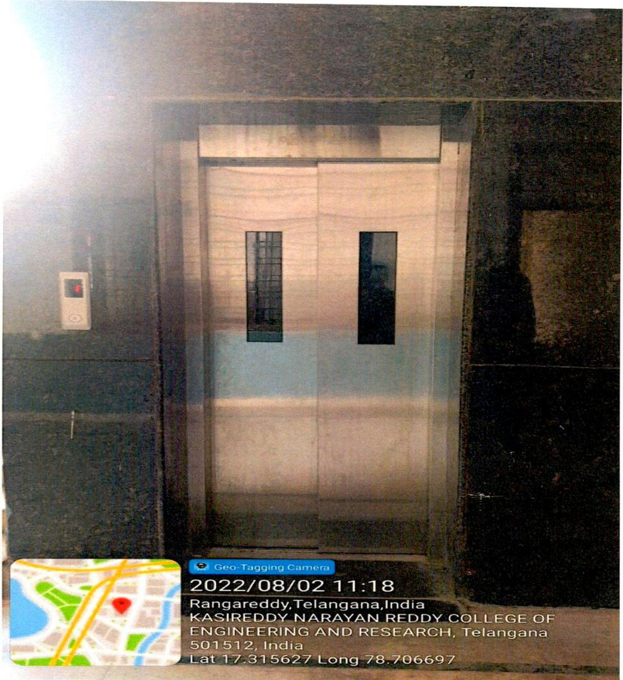
Lift at KNRCER

PRINCIPAL KASIREDDY NARAYAN REDDY COLLEGE OF ENGINEERING AND RESEARCH Abdullapur (V), Hayathnagar (M). R.R. District-501 505.