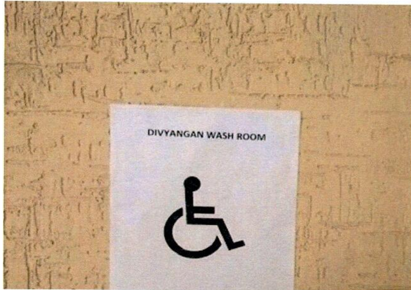
Signages used at KNRCER

PRINCIPAL KASIREDDY NARAYANREDDY COLLEGE OF ENGINEERING & RESEARCH Abdullapur (V), Hayathnagar (M), R.R. District-501 505.